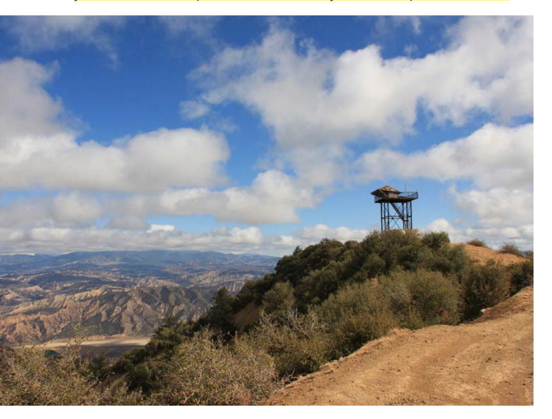
Cuyama Peak Lookout, Fall 2013

• p 13, the cab of the Cuyama Peak Lookout collapsed in the early Winter of 2012.