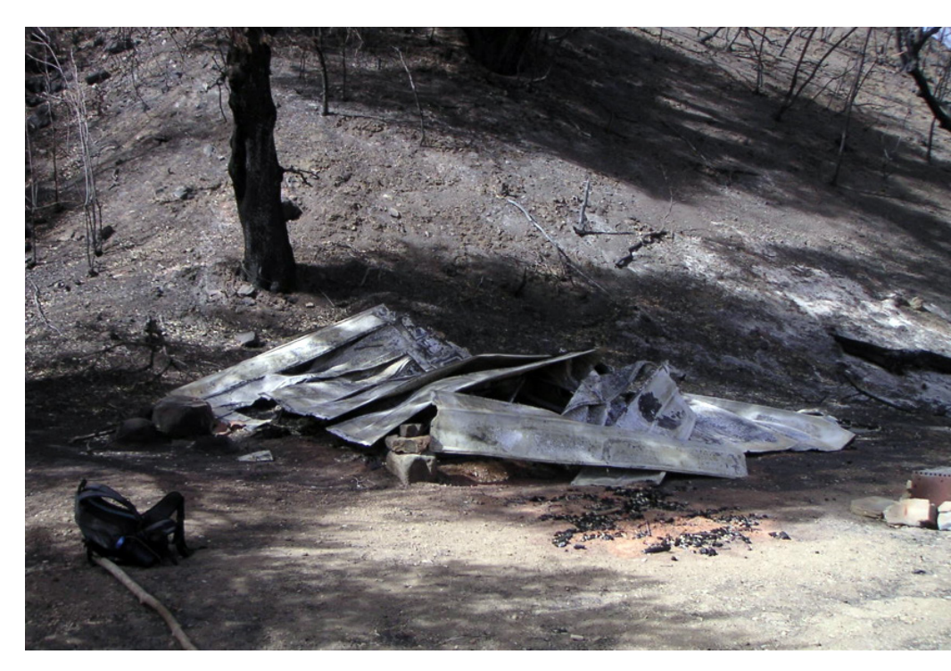
Alamar Tin Shack post-Zaca (2007)