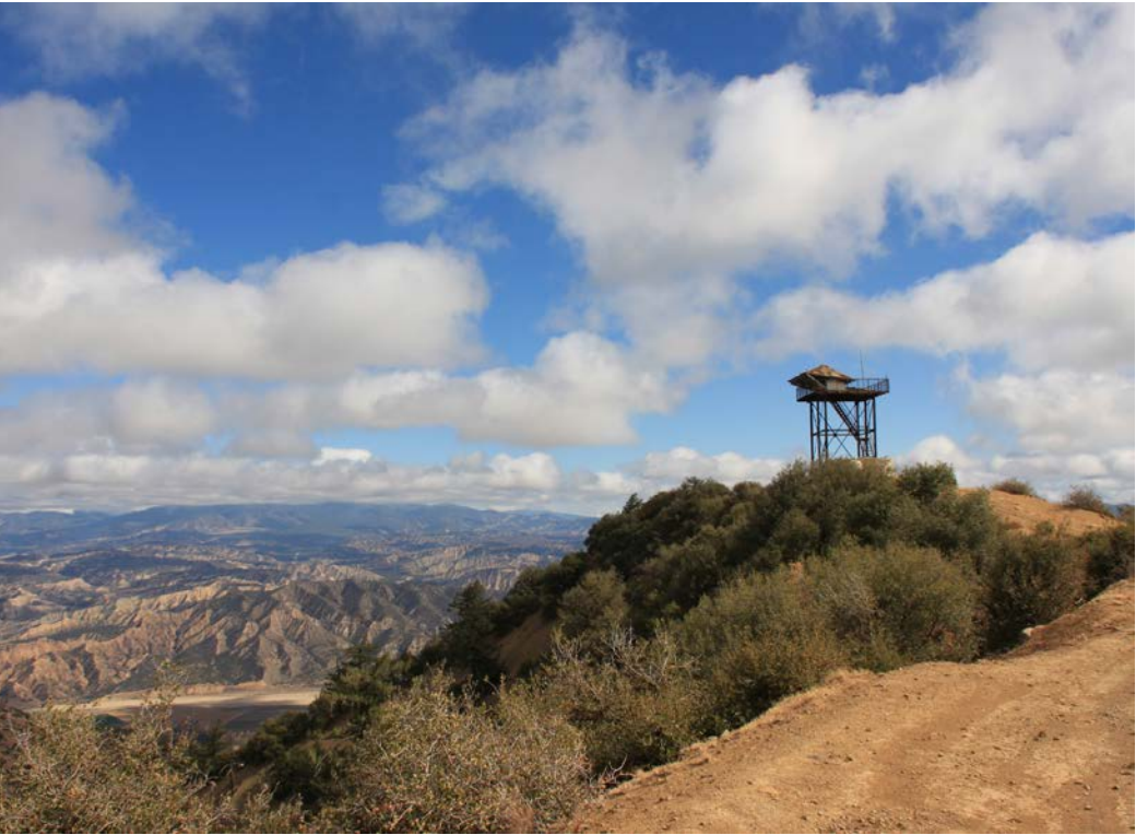
Cuyama Peak Lookout, Fall 2013