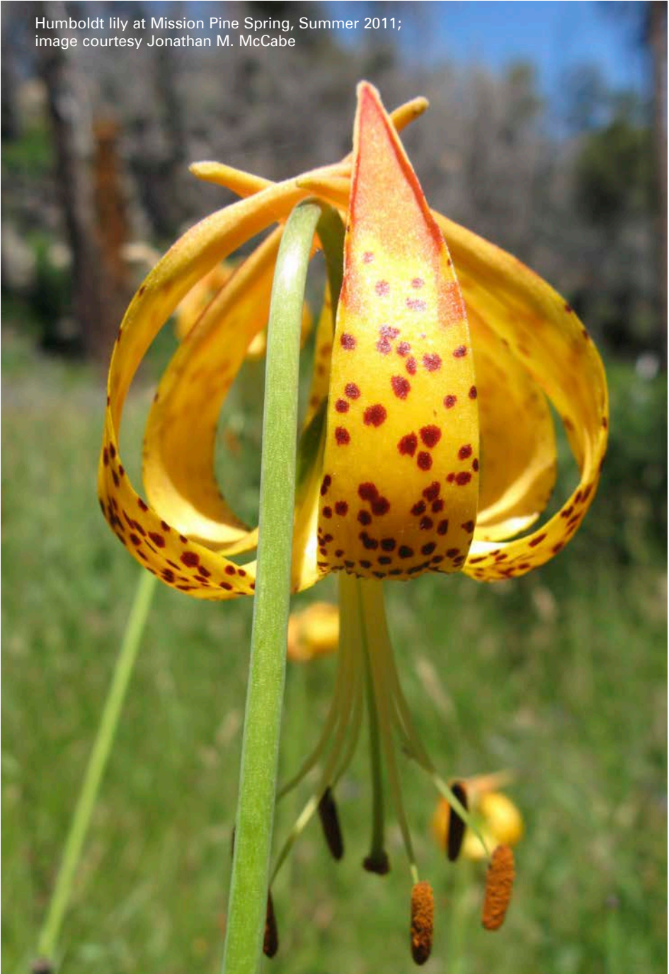
Humboldt lily at Mission Pine Spring, Summer 2011