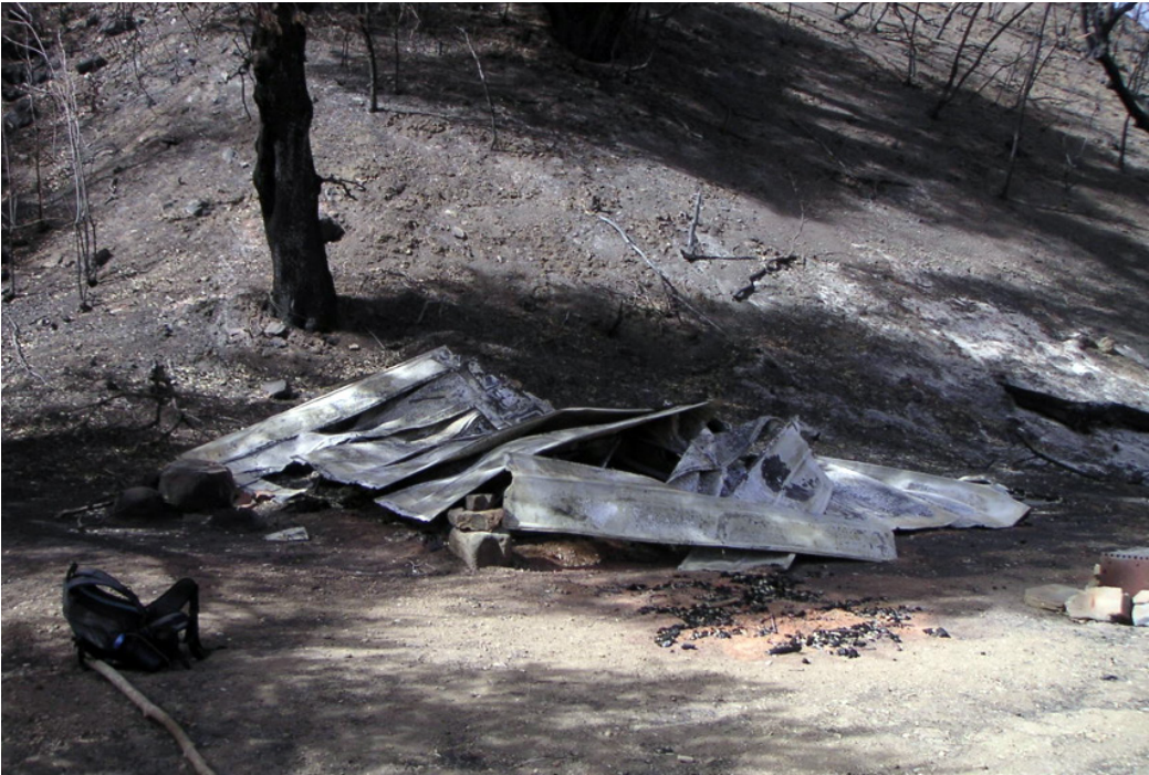
Alamar Tin Shack post-Zaca (2007)